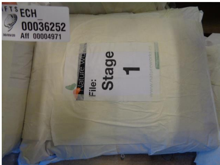
Sample ref. : Stage 1 (1) supplied by NATURE WORKS TECNOLOGIAS